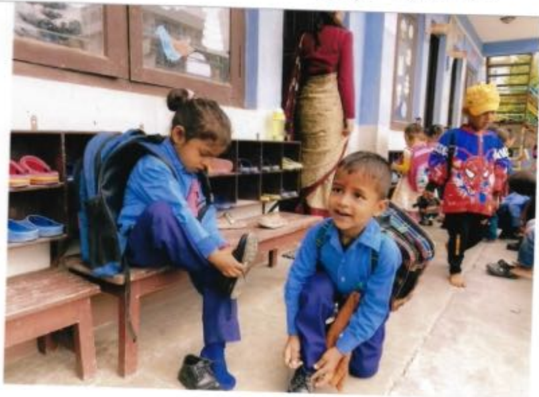
Time to go home.....