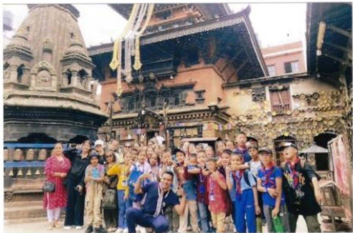
Khetipur - Adhi Nath Temple