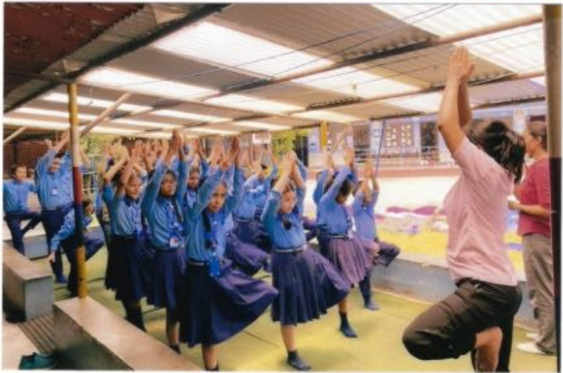
Yoga training for the children