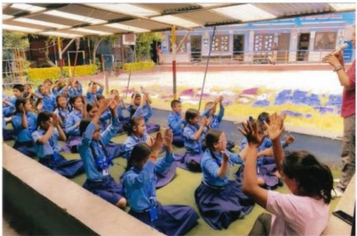
Happy Clap - Happy Smile . . . .