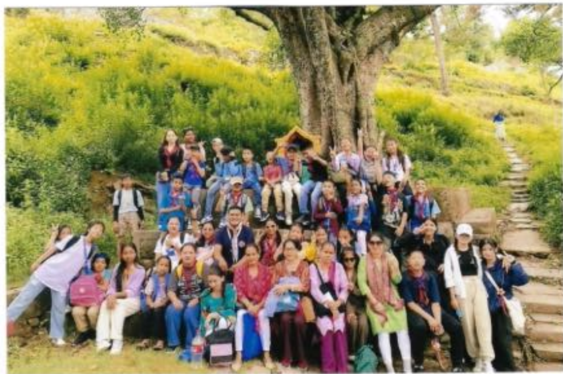
Santaneshwor - Mahadev Area.