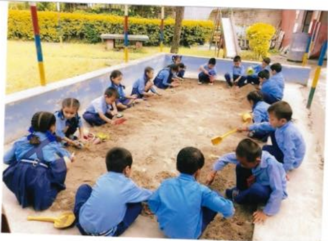
Before going home - enjoying the Sand-Box area.