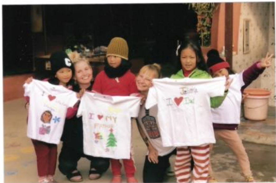
T-Shirt painting training by the volunteers.