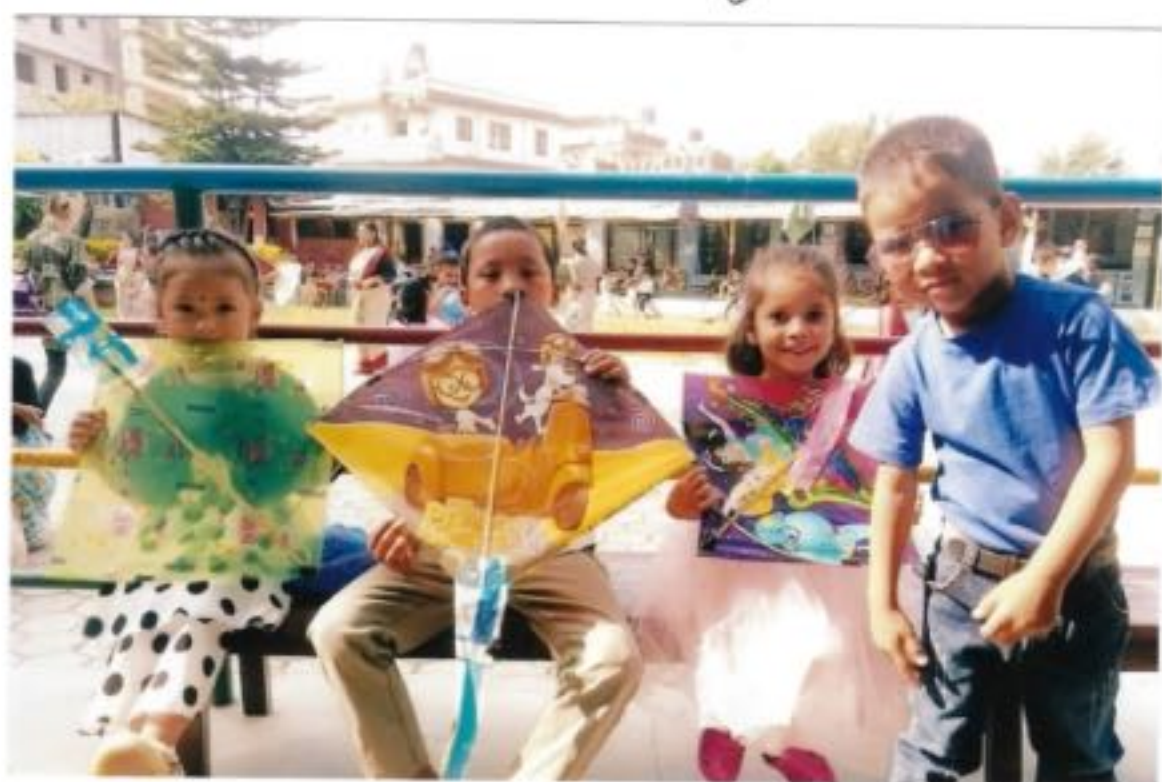
Dashain - Tihar Festival. Kite - flying in the school.