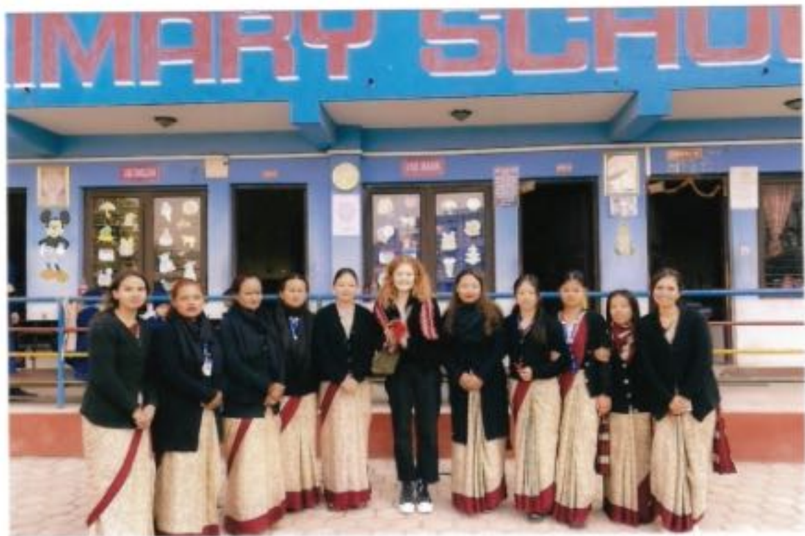
A group photo with the teachers.