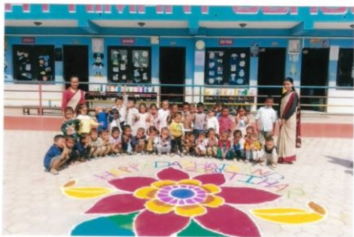
Mandala - made by the children.