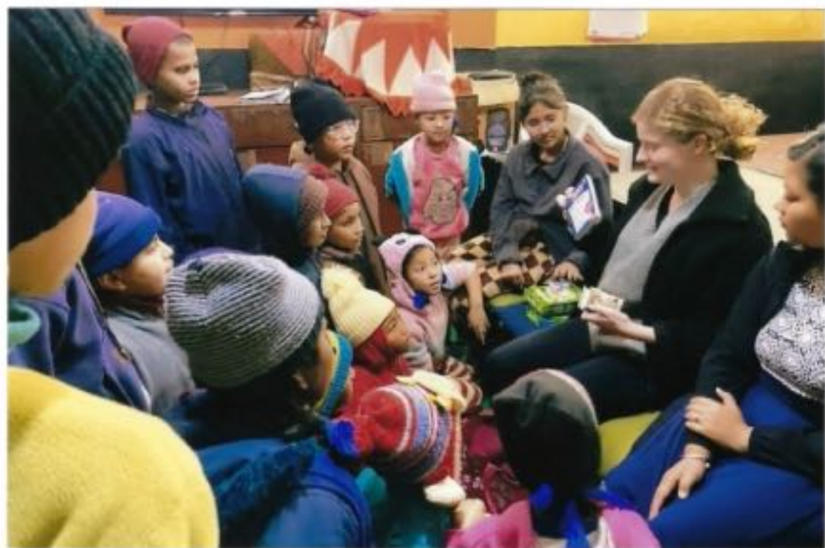
She was also very popular with the hostel kids. Always busy and enjoying!