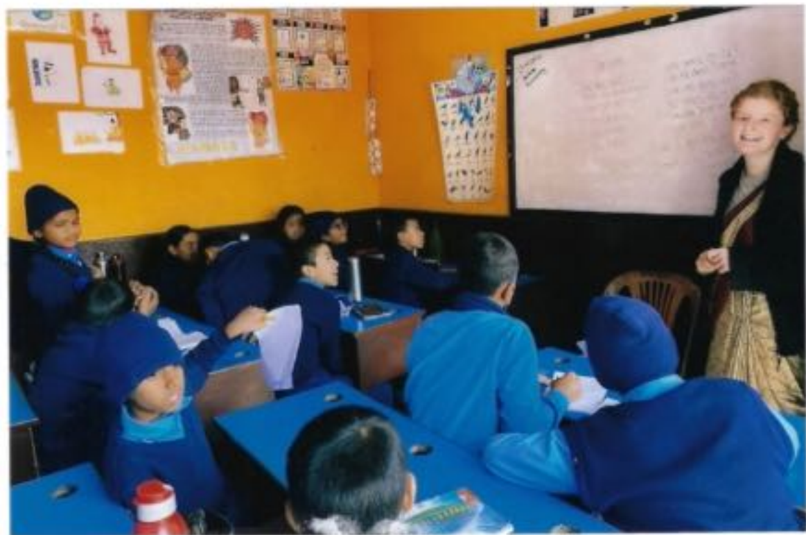
She was always busy and happy to be with the kids.