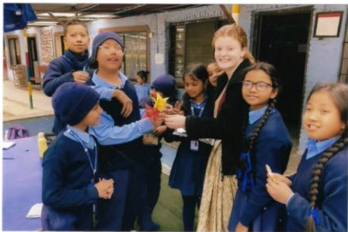
Handy Craft training.